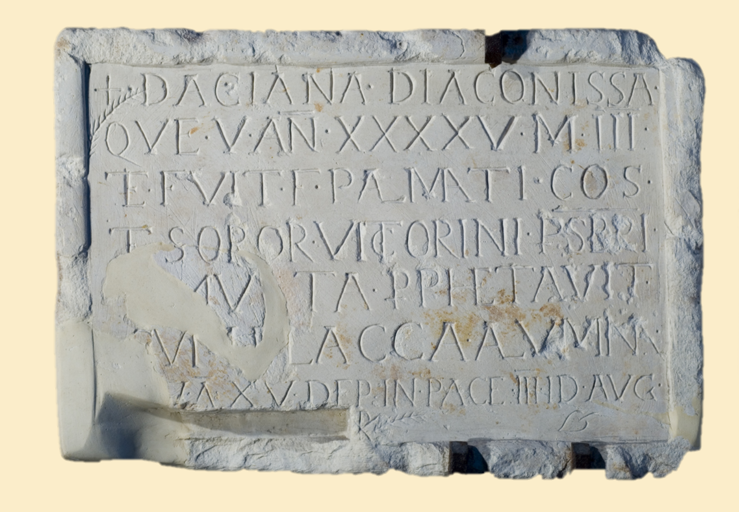
Forged inscription from Ferrara in the Museo Lapidario Maffeiano (Verona, CIL V 180*)

Forged inscription from Rome in the Villa Due Pini in Montecassiano (Macerata, CIL VI 25292)